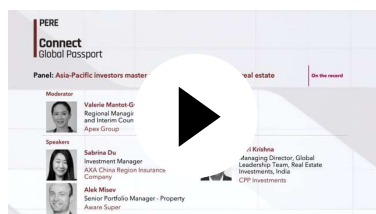
Asia-Pac investors master plan for capital allocation